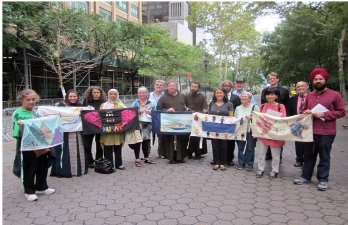
New York City, 2018